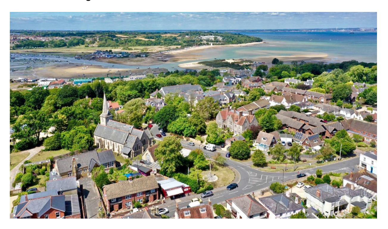
"Four miles south of mainland Britain sits a diamond in the Solent, an island paradise blessed with golden beaches, verdant forests, ancient valleys and chalk white cliffs. It's a land steeped in rich history, favoured by Kings and Queens and today the home of a thriving community proud of their heritage and tradition. Welcome to the Isle of Wight..."